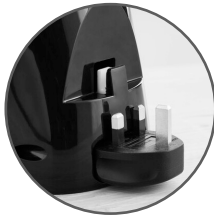
Hidden Cord Storage